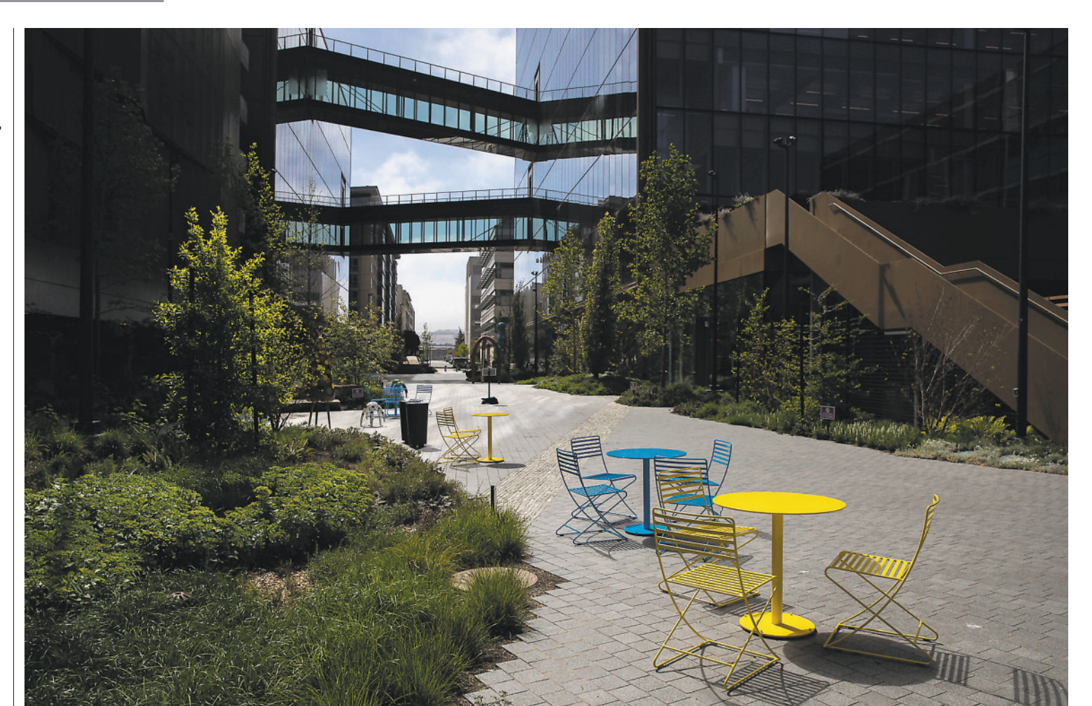
Colorful tables and chairs line Pierpoint Lane between Third Street and Bridgeview Way at Uber's new headquarters.

Erin Allday is a San Francisco Chronicle staff writer. Email: eallday@sfchronicle.com Twitter: @erinallday